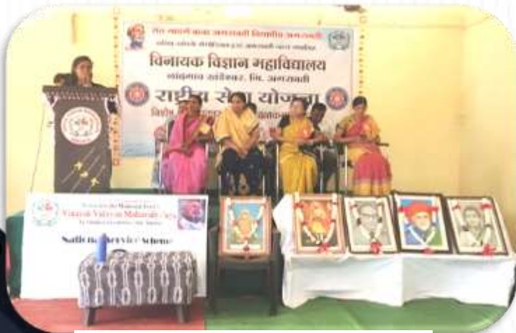
Inauguration of NSS camp at Kanjara village