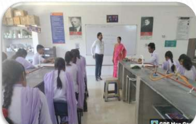
Participation of students in GAT 2024 conducted by AUCTA, Amravati.