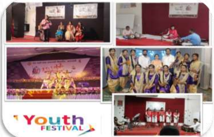
Participation of Students in various events in Youth Festival 2023-24