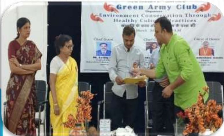
Department of Zoology and Green Army Club organized Workshop on Eco-friendly Holi Colours