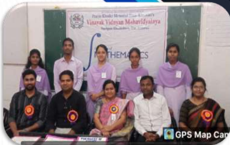
Inauguration of Mathematics Society