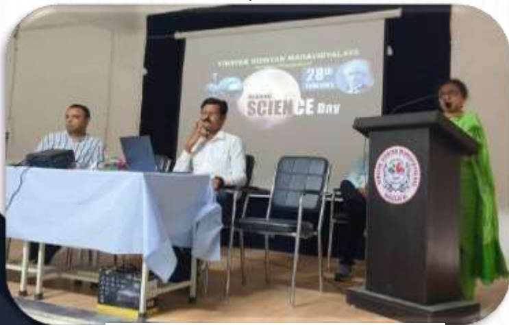
Celebration of National Science Day -2024