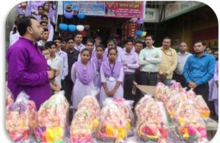
"MY BAPPA" 2023 ...Department of Zoology , Green Army Club and WECS joint activity to promote use of Clay Ganesh Idol.