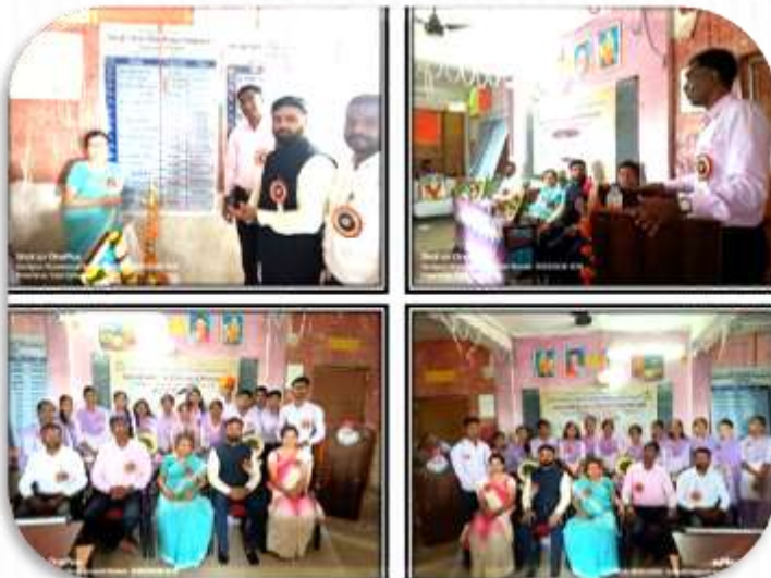
Inauguration of Language Club