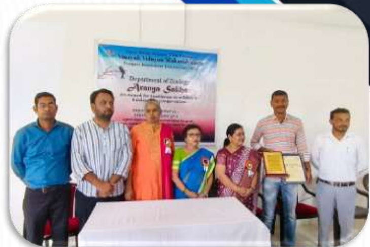
"Aranya Sakha" Award for young conservationist. Department of Zoology