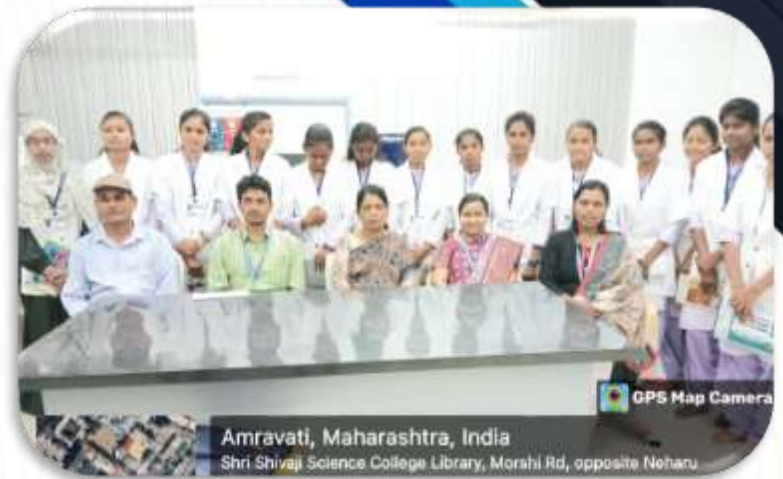
One day educational visit to Regional Forensic Science Lab, Amravati.