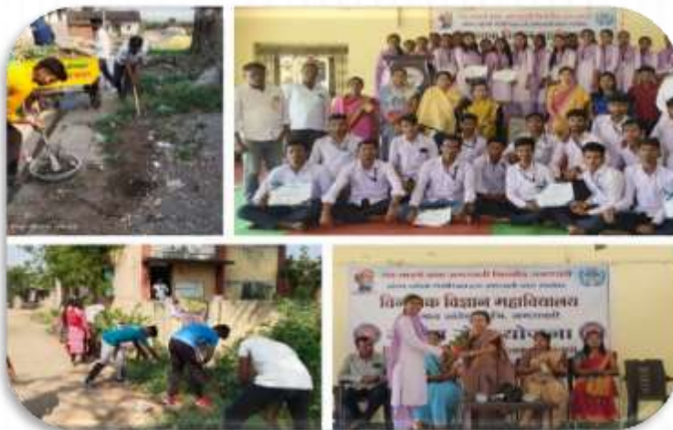
NSS Volunteers Activities at Kanjara village