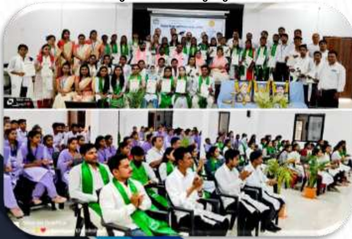
Celebration of Shri Degree Distribution Ceremony 2023-24