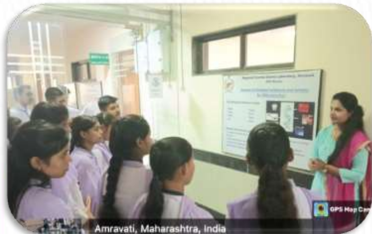
Amravati, Maharashtra, India